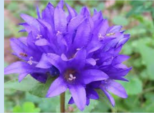
CAMPANULA BRAVENISIS (BELLFLOWER)