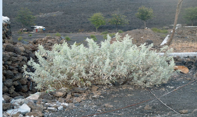
LOSNA A PLANT OF FOGO ISLAND