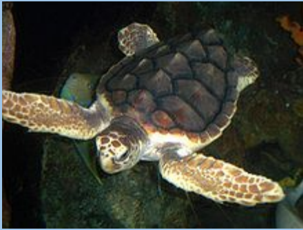
LOGGERHEAD SEA TURTLE

CAPE VERDE IS SURROUNDED WITH WATER SO THEY HAVE A LOT OF MARINE BIOLOGISTS STUDYING THE ANIMALS