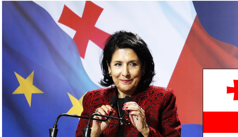
Salome Sourabichvili president