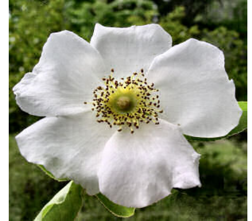
National Flower: Rosa laevigata

Native Plants: Bottlebrush Buckeye, Rosa laevigata, Birch, French Mulberry