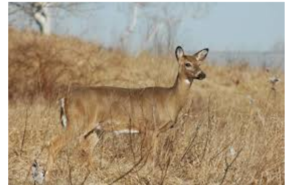
National Animal White-tailed deer