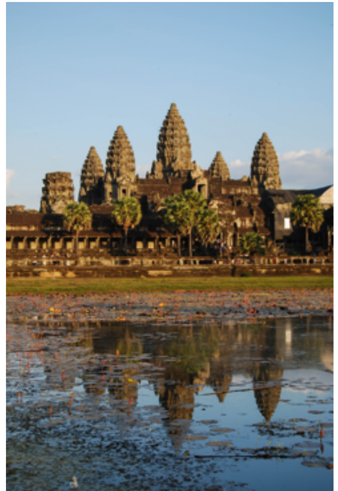
Angkor Wat, a historic Buddhist temple